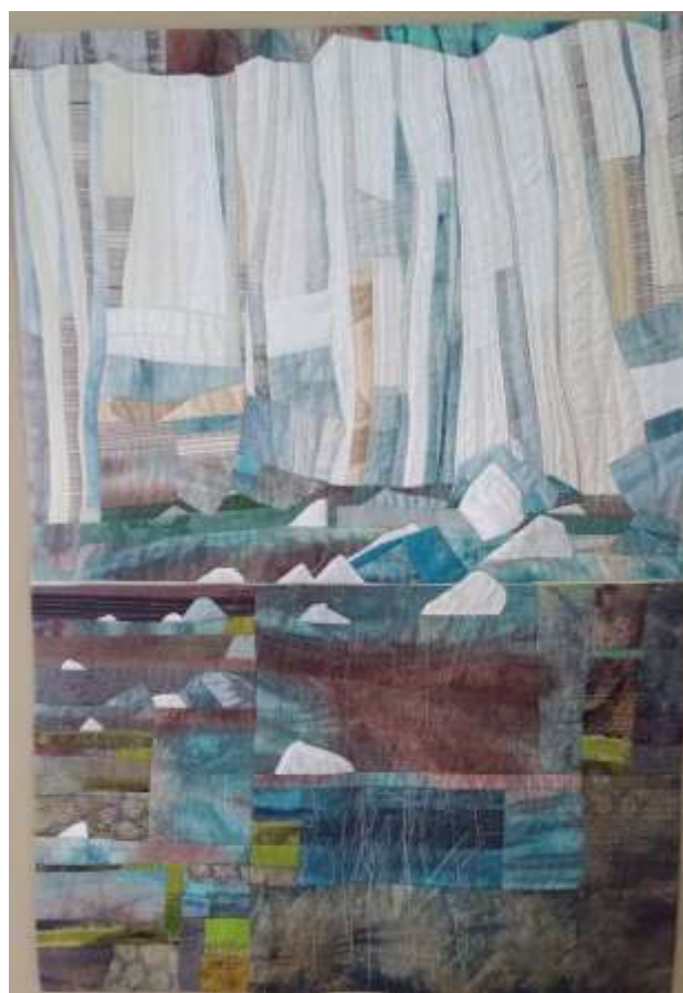
ABOVE: Alaska. Made for a friend who took me on a cruise to Alaska. The quilt shows a combination of Glacier Bay and the Medenhall Glacier.

LEFT: River Walk - free motion machine embroidered. Made for a friend to commemorate where she walked with her late husband.