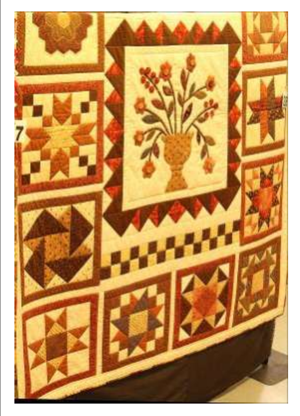
Due to circumstances beyond our control names are not available. Apologies to the talented quilters.