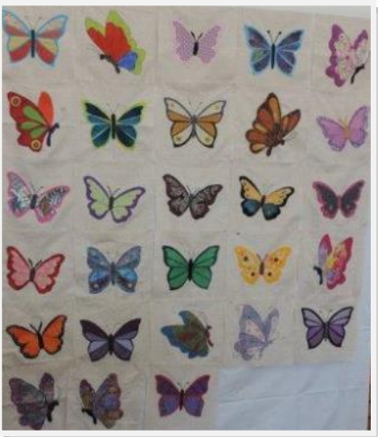
Members contribution for a charity quilt

A new member, showed us her quilt featuring a quirky cat fabric incorporated in a snowball design